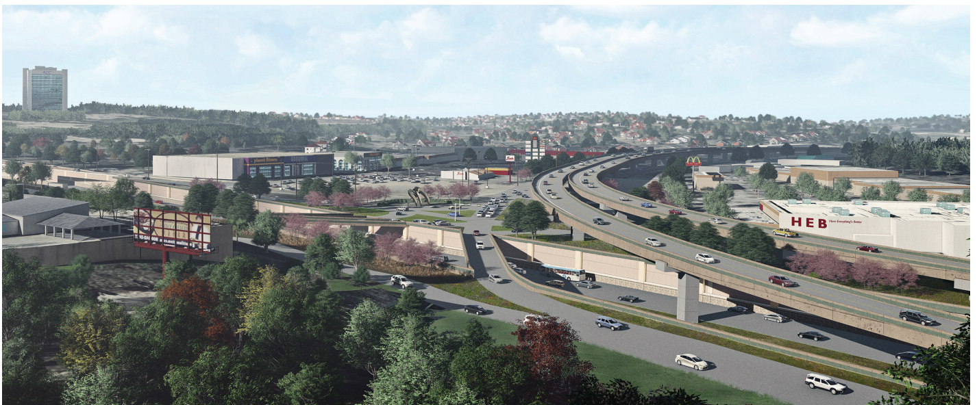
All features illustrated in this rendering are proposed and considered an artistic rendering for conceptual purposes only. Subject to change.

This proposal would require acquisition of new right of way, including four commercial property displacements and one single-family residential property displacement. Other impacts include tree and vegetation removal and the potential for traffic noise mitigation through sound walls.