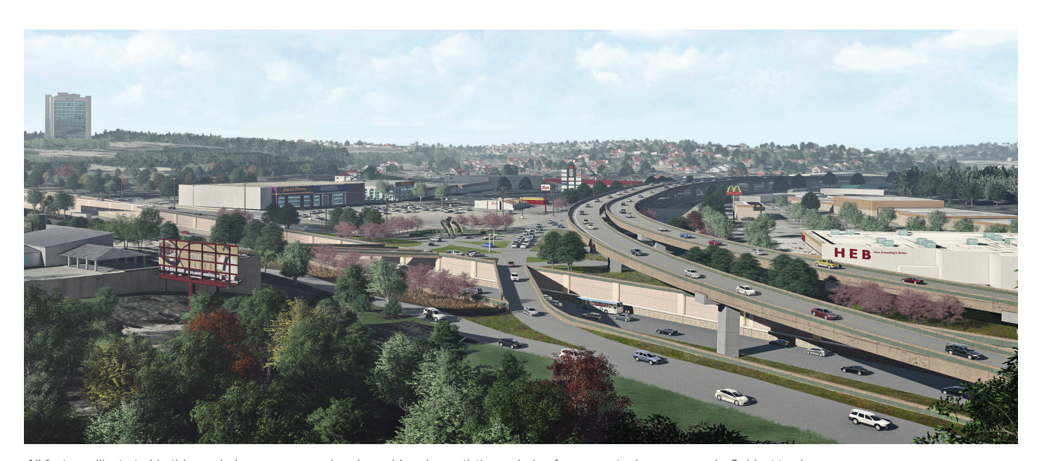
All features illustrated in this rendering are proposed and considered an artistic rendering for conceptual purposes only. Subject to change.

This proposal would require acquisition of new right of way, including four commercial property displacements and one single-family residential property displacement. Other impacts include tree and vegetation removal and the potential for traffic noise mitigation through sound walls.